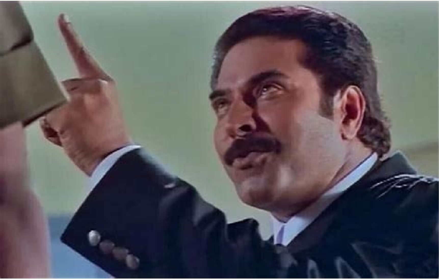
Narasimham malayalam movie release date. Mammooty malayalam hit movies. List of mammooty malayalam movies.